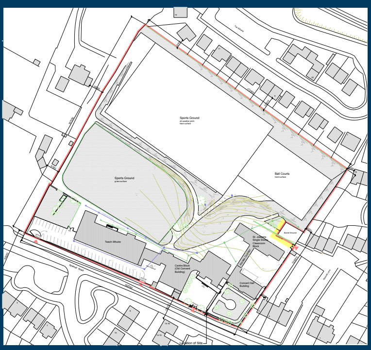
Indicative Site Outline Only

The site represents a prime development opportunity within Wexford Town. It is situated in an area with an established pattern of residential development with sea views given the site's elevated position. It benefits from amenities and services and would ideally suit a residential development, subject to planning permission, capitalising on the high levels of demand in the residential market.